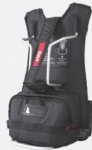
Nylon Backpack (for portable repeater only)(black) NCN010