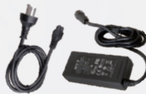
Power Adapter for Portable Repeater PS7502