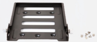
Multi-Functional Installation Bracket BRK17

Optional antenna designed by Hytera is highly recommended. *Outdoor use of RD96X with antenna should avoid thunderstorms.