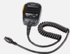
Waterproof Remote Speaker Microphone ( IP67 ) SM18A1

Optional antenna designed by Hytera is highly recommended. *Outdoor use of RD96X with antenna should avoid thunderstorms.