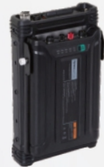
Power Management System PV3001